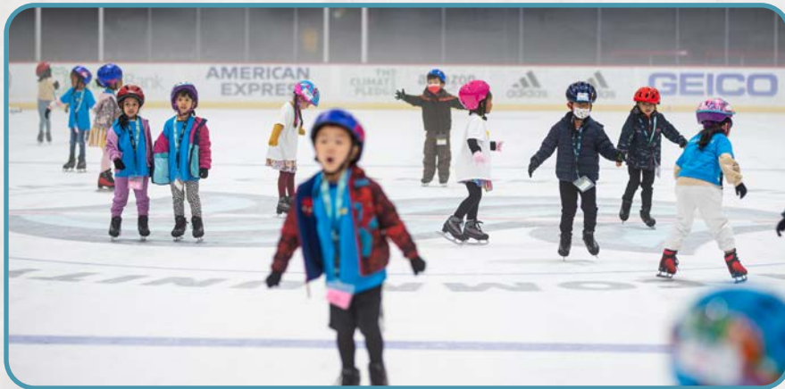
▲ ReWA students celebrate skate success