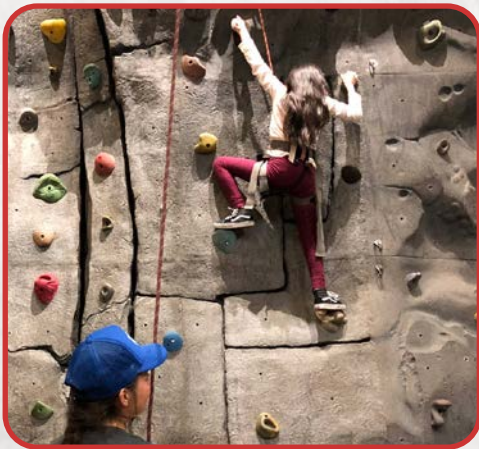
▲ Youth learn to climb

91 volunteers gave 1,511 hours to assist youth and adult learnings to learn English, practice for citizenship exam, and explore STEAM projects after school.