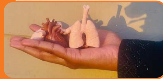
▲ Building blocks for academic and career confidence