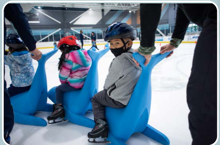
▲ Children learn to skate

One ECEAP family who participated in the learning group applied and received additional scholarship to continue the lessons in the summer, as well as in September 2022. Without the path ReWA provided, this family and many other families wouldn't have been able to introduce ice skating to their kids at such a young age.