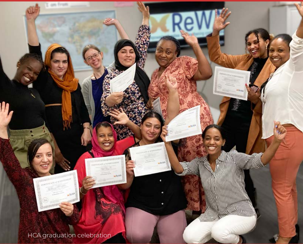
HCA graduation celebration