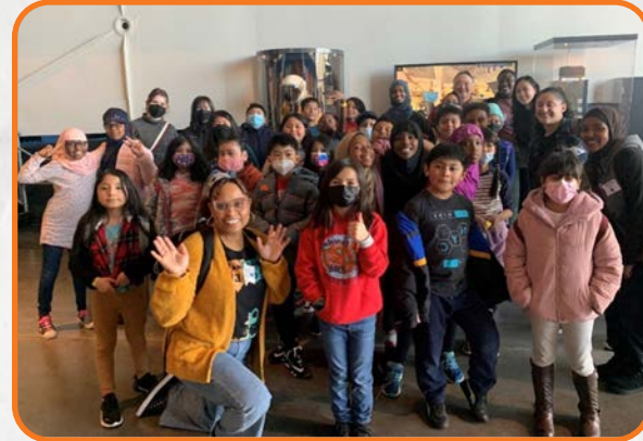
▲ Youth field trip