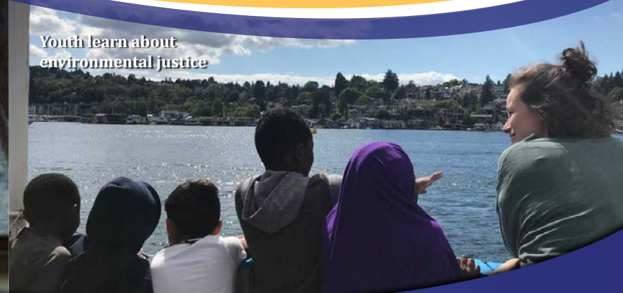
Youth learn about environmental justice