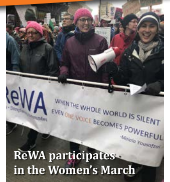
ReWA participates in the Women's March

To sponsor or participate in our events, please email development@rewa.org .