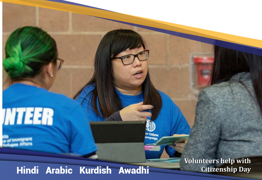
Volunteers help with Citizenship Day

Individual donors who contribute directly to ReWA give us the flexibility to respond to the needs of our clients as they arise. Donors are updated throughout the year and are invited to our special events. Through social media campaigns and employee match programs, our donors have more than doubled their generous investments while raising awareness for the work we do. To learn more, please visit www.rewa.org/get-involved .